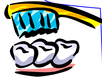
toothbrush & teeth