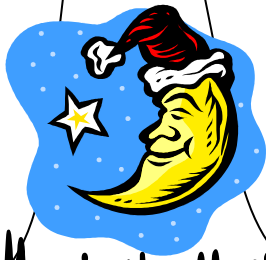
Man in the Moon